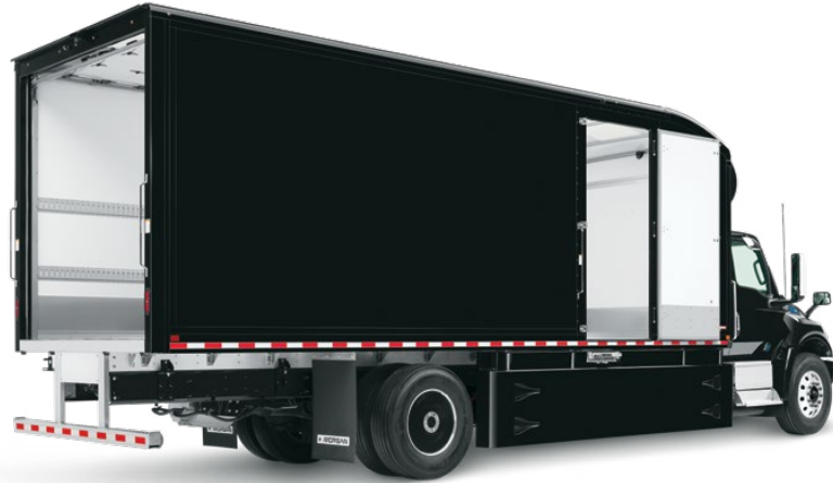
MID-PANEL TRANSLUCENT ROOF LED STRIP LIGHTING

LED strip lighting provides efficient and consistent light throughout the length of the body.