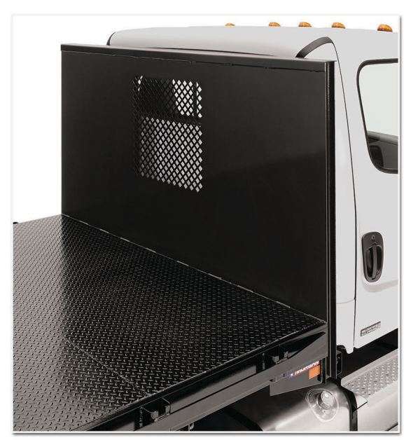
Morgan's bulkhead design, provides the strength and protection you expect, plus added visibility to your cargo