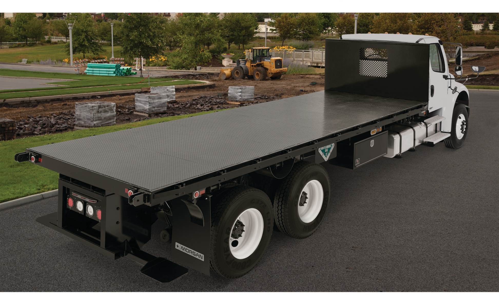
Stake Platform - MHP