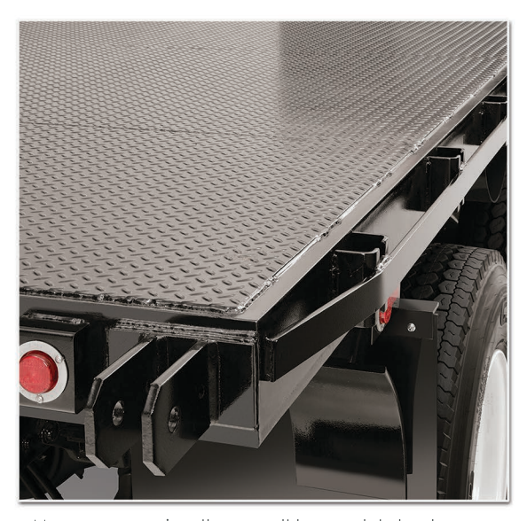
Morgan recognizes the assault heavy-duty haulers may have to endure. That's why they designed in features such as -- structural outside rails for added platform strength. heavy-duty formed steel stake pockets, and steel rub-rails welded over side stake-pockets - to mitigate downtime, and help ensure that your MHP performs time and again!