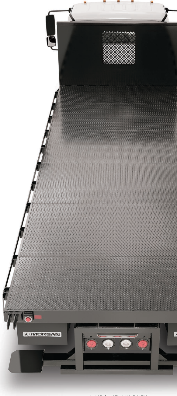
MHP is HEAVY-DUTY making it the bench-mark by which others are n