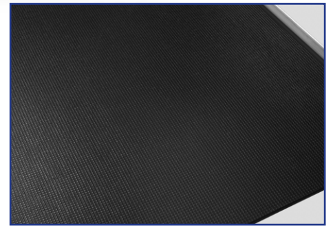
Slip- Resistant 21MM Phenolic Wood Flooring