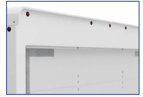
Painted Galvanized Steel Frame