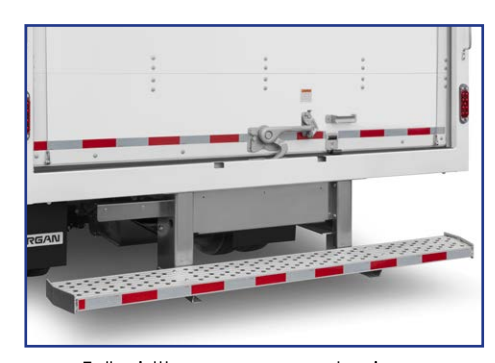
Full-width, easy access aluminum step bumper