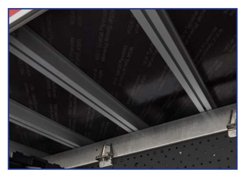
Our design hard mount installation helps prevent unplanned downtime, costly maintenance & unwanted repair costs